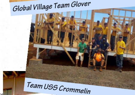
Team USS Crommelin