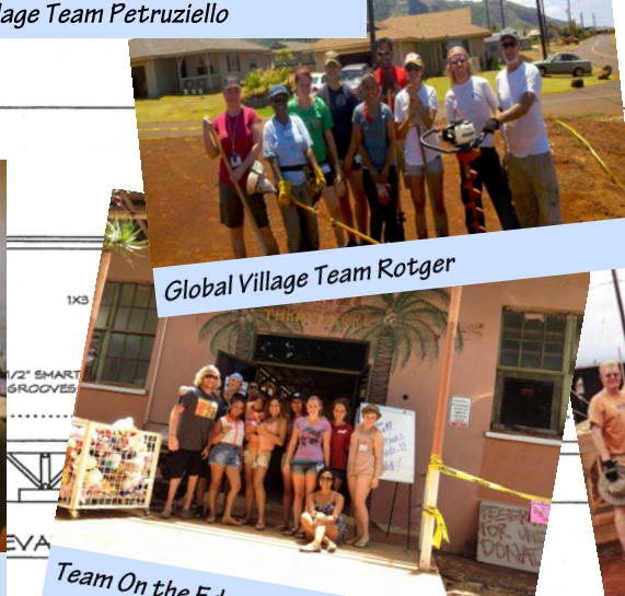
Global Village Team Rotger