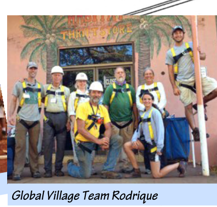
Global Village Team Rodrique