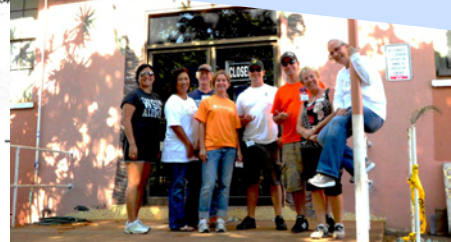
Team Grand Hyatt Resort